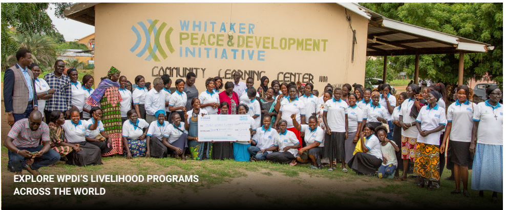
EXPLORE WPDI'S LIVELIHOOD PROGRAMS ACROSS THE WORLD