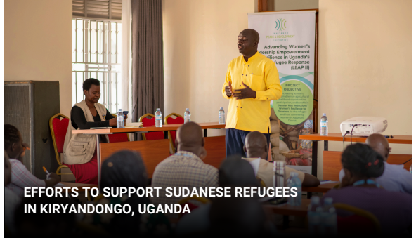
EFFORTS TO SUPPORT SUDANESE REFUGEES IN KIRYANDONGO, UGANDA