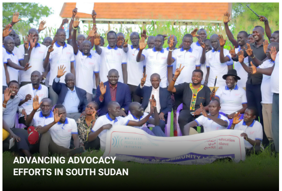
ADVANCING ADVOCACY EFFORTS IN SOUTH SUDAN